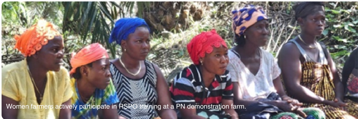
Women farmers actively participate in RSPO training at a PN demonstration farm.

“AgDevCo’s Technical Assistance has enabled Planting Naturals to transform how we work with our smallholder farmers. Through support for our partnership with KOLTIVA, we have implemented digital traceability tools that map farms, capture sustainability data, and prepare us comprehensively for EUDR compliance. Beyond compliance, this has strengthened farmer relationships, improved data accuracy, and enhanced transparency across our supply chain. Most importantly, it empowers smallholders to participate in verified deforestation-free markets, securing their livelihoods while protecting forests.”