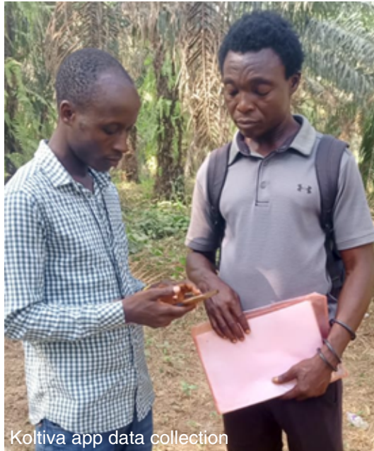
Koltiva app data collection